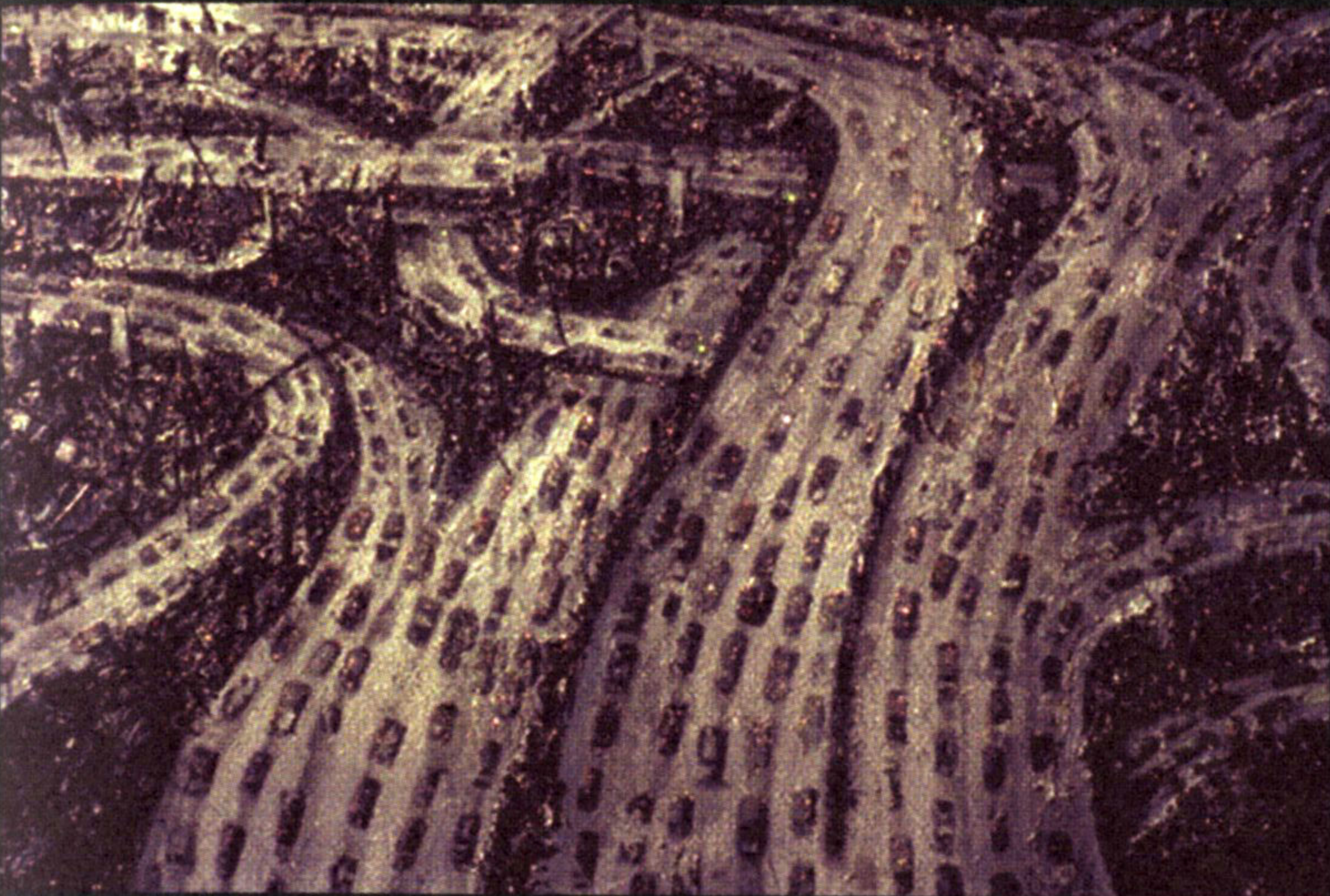
Paving America #6.